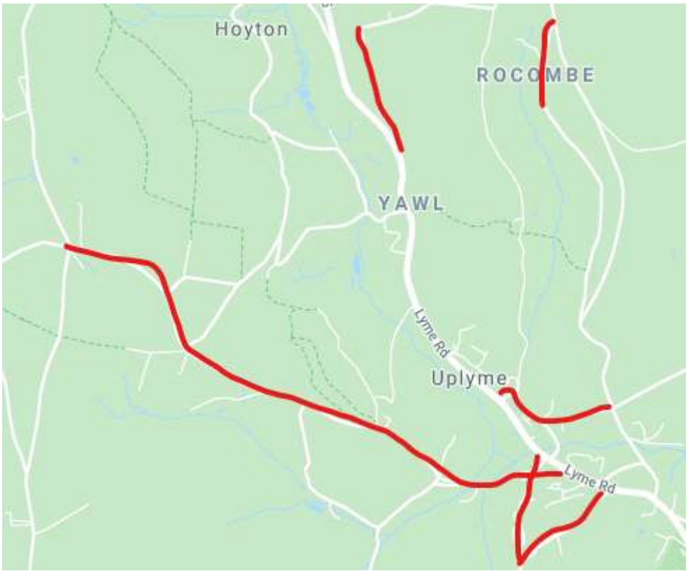
12. (Medium Priority) Yawl Lane – Red Lane – Harcombe Road – Church Street – Springhead Road - Rhode Lane